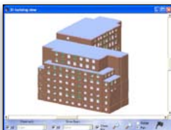
3D Building View

A fully accredited standalone CAD EPC (Energy Performance Certificate) program for the Energy Assessment Industry. Energy Assessor professionals can create certificates to meet United Kingdom Government Part L legislation. Uses a full CAD interface and a simplified data entry interface and is intended for larger buildings (Level 4) as well as Level 3.