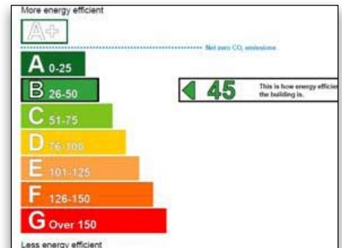
Energy performance certificates