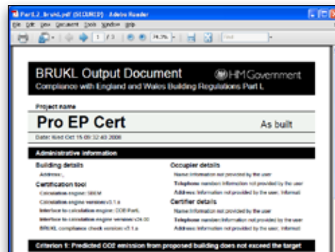
BRUKL output document